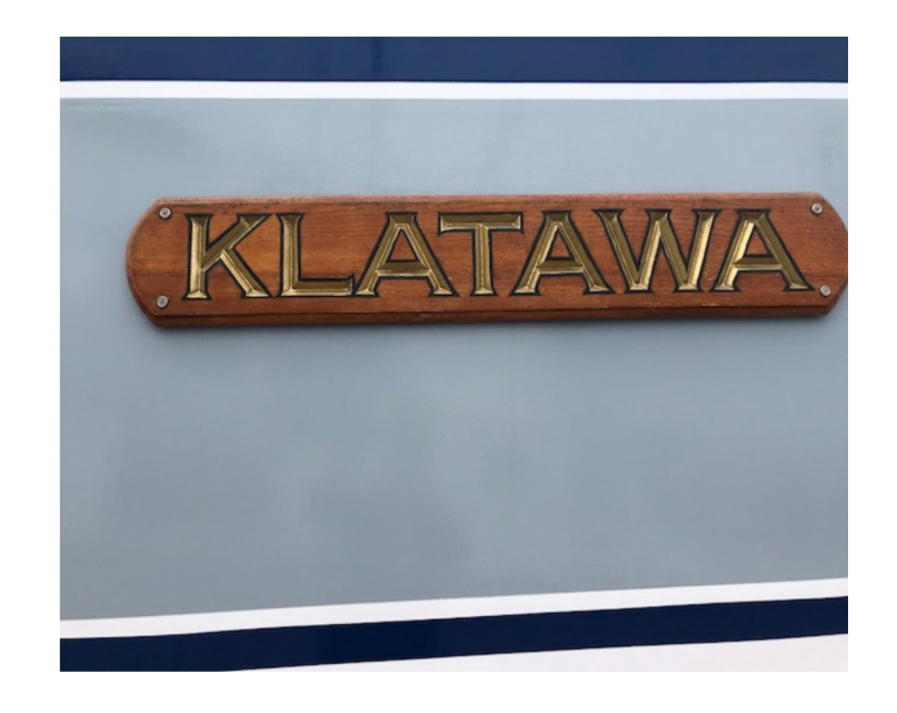
Name of Vessel